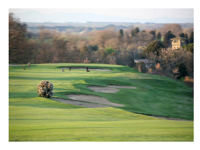
Day 17 – Saturday 4 November 2017 – Rome/Civitavecchia – in port 5 am