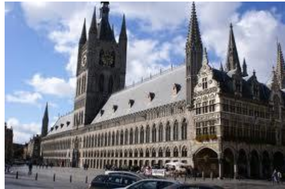
Ypres Cloth Hall in WW1 (left) and rebuilt (right)