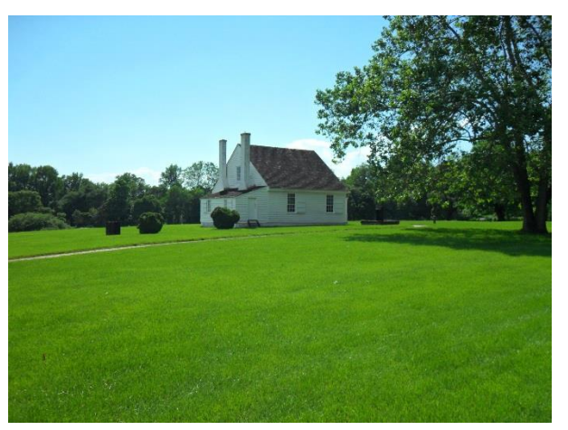
Day 4 – Wednesday 27 September - Battle of Chancellorsville

The Battle of Chancellorsville in May 1863 is famous for the great Confederate victory of General Lee over General Hooker, tempered by the heavy casualties and death of Stonewall Jackson by friendly fire. This battle is frequently viewed as Lee's greatest victory since it was achieved over a Union Army twice the size of the Confederate Army and saw Lee take a bold and risky decision to divide his army in the presence of the much larger Union force.