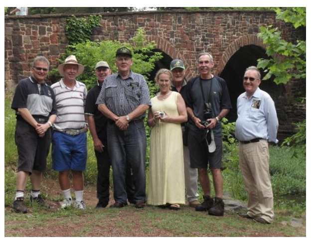
Day 2 - Monday 25 September - Manassas

During the Civil War, the North generally named a battle after the closest river, stream or creek and the South tended to name battles after towns or railroad junctions. Hence the Confederate named Manassas after Manassas Junction while the Union named Bull Run for the stream Bull Run.