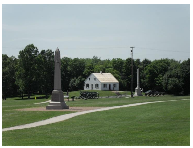
Day 6 – Friday 29 September – South Mountain, Harpers Ferry and Battle of Antietam

Accommodation – Shepherdstown – 2 nights