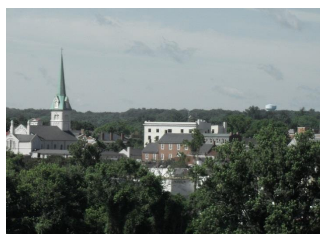
Day 3 – Tuesday 26 September – Battle of Fredericksburg

We farewell Washington and drive one hour south to Fredericksburg, the town which adjoins the famous battlefield.