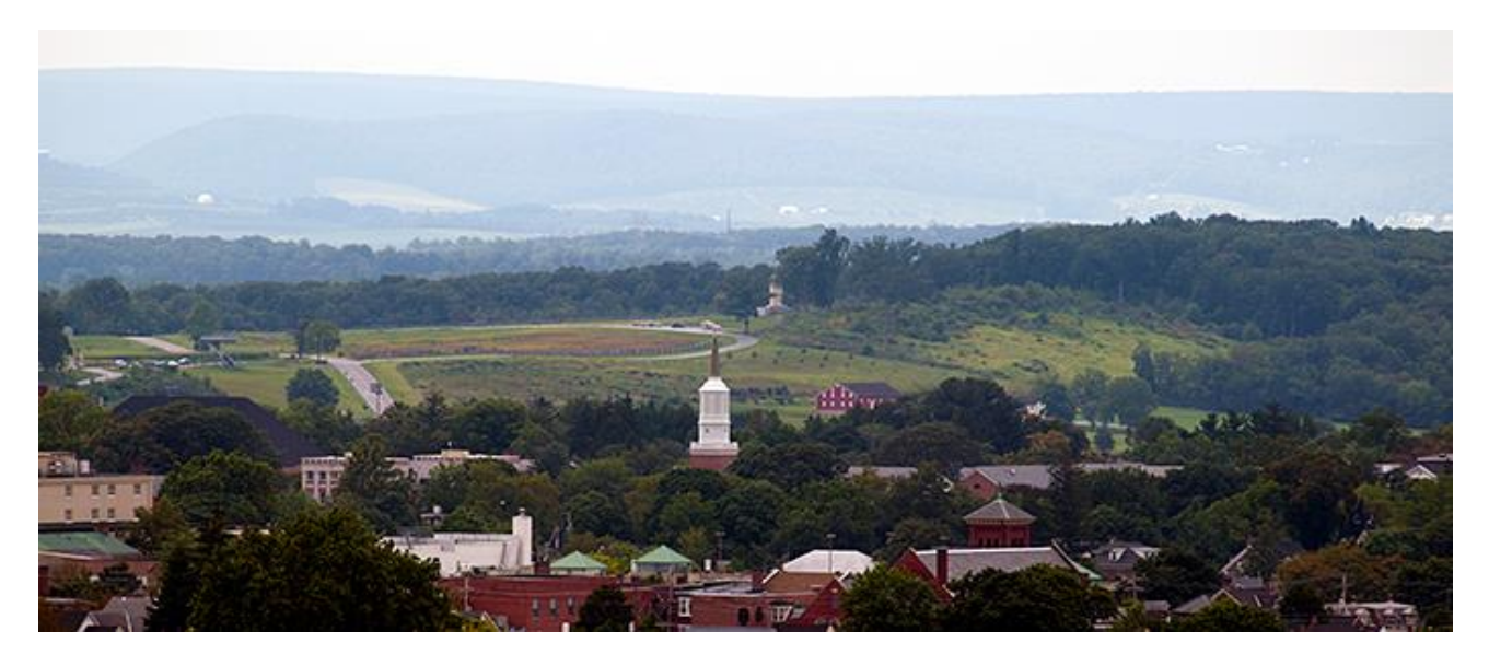
(photograph above is of Gettysburg today looking north west)

Our afternoon will commence with a 1 and ½ day guided tour of the full Gettysburg battlefield with one of the park's licensed battlefield guides. Today, we will commence with covering the 1<sup>st</sup> day of the battle – that being from the first shots at Cashtown through to the Confederate troops occupying the town of Gettysburg by the end of the day's hostilities.