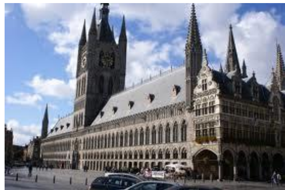
Ypres Cloth Hall in WW1 (left) and rebuilt (right)